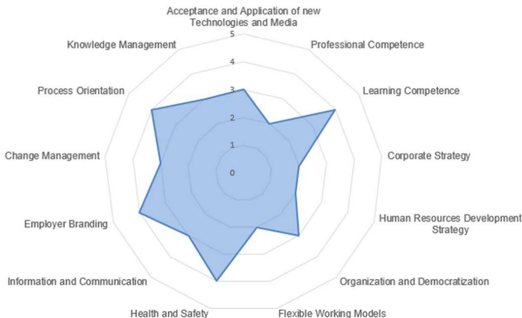
Figure 5. Actual Maturity Level.

After a company has detected its actual maturity level, a decision about the dimensions to be further developed in order to reach a higher level of maturity has to be made. Defining such a digitalization strategy should follow systematic strategy processes and demands an intensive discussion with industry 4.0. As one can see in Figure 5 within the pre-test the company defined itself on maturity level 2 in terms of the corporate strategy. Thus, the company has only begun to deal with industry 4.0 so far, for what reason it was not possible to define the target maturity level within the same workshop.