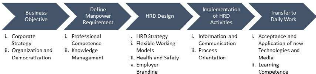
Figure 3. Areas of Development in the field of Human Resources.

The capability maturity model Human was conducted in order to underline the position and relevance of humans as a central component in industry 4.0 [20]. The field of action is across the board and covers necessary competences and organizational requirements regarding digitalization. Thus, Human Resources (HR) is not only a separate department but influences all parts within a company. As pointed out, the capability maturity model addresses different areas of development in the field of HR and includes five levels of maturity each. The individual areas are derived from the strategic HR approach of Ryschka (see Figure 3) [21]. However, the individual process steps have been further specified in order to fit practical needs [22].