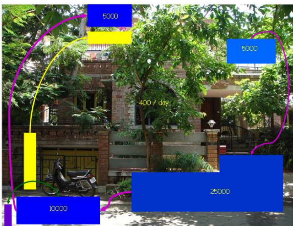
Figure 3. Rainwater harvesting in Sourabha.

The remaining portion of the roof water (15%) is allowed to rundown through rainwater pipe on the wall and a PopUp filter installed at the ground level filters suspended and floating material. Relatively cleaner water after filtration flows to an underground sump-2 of 10,000 lt Capacity built inside the car park (garage). Sump-1 and sump-2 together with 35,000 lt capacity are interconnected and the stored rainwater water is used during the non rainy days when the roof top tank water is not available.