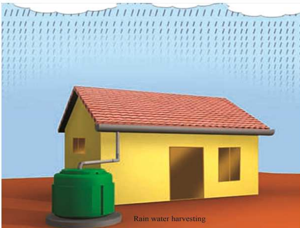
Figure 1. Rainwater Harvesting from building roof.

Realized the importance of harvesting rainwater and as a first step through BWSSB, RWH has been made mandatory for most of the properties in Bangalore since Nov 2009.