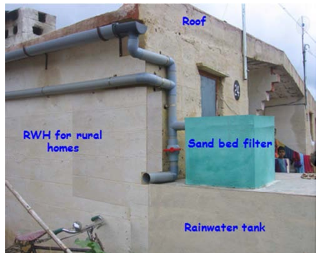
Figure 2. RWH in village home.

RWH cell established at KSCST is providing policy support to the Government departments for water conservation and rainwater harvesting programmes in Karnataka and other states in India (Figure 2). The guidelines established by RWH Cell are instrumental in pursuing State Government to amend several acts and issue guidelines for mandatory installation of RWH structures in all the government buildings, public parks, roads and open spaces. Bangalore Water Supply and Sewerage Board (BWSSB) has collaborated with RWH Cell of KSCST and brought in the legislation to compulsorily install RWH system in certain category of properties in Bengaluru.